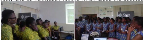
Fig. 1 Sensitization activities for students in Ghana.

The CTBTO is championing nuclear non-proliferation education to bring to public knowledge the ban on nuclear test and its verification regime, and particularly to encourage the young generation's involvement in its activities. To promote the CTBT, you will need the active engagement of young generation such as students and young graduates. Their involvement is an essential contribution towards global peace and security, and vital to advancing the Treaty's entry into force. Public sensitization programmes are some of the key ways of improving public knowledge and understanding of the crucial matters relevant to the CTBT's establishment (Fig.1). Thus, creating increased awareness to promote the Treaty's universal acceptance and entry into force.