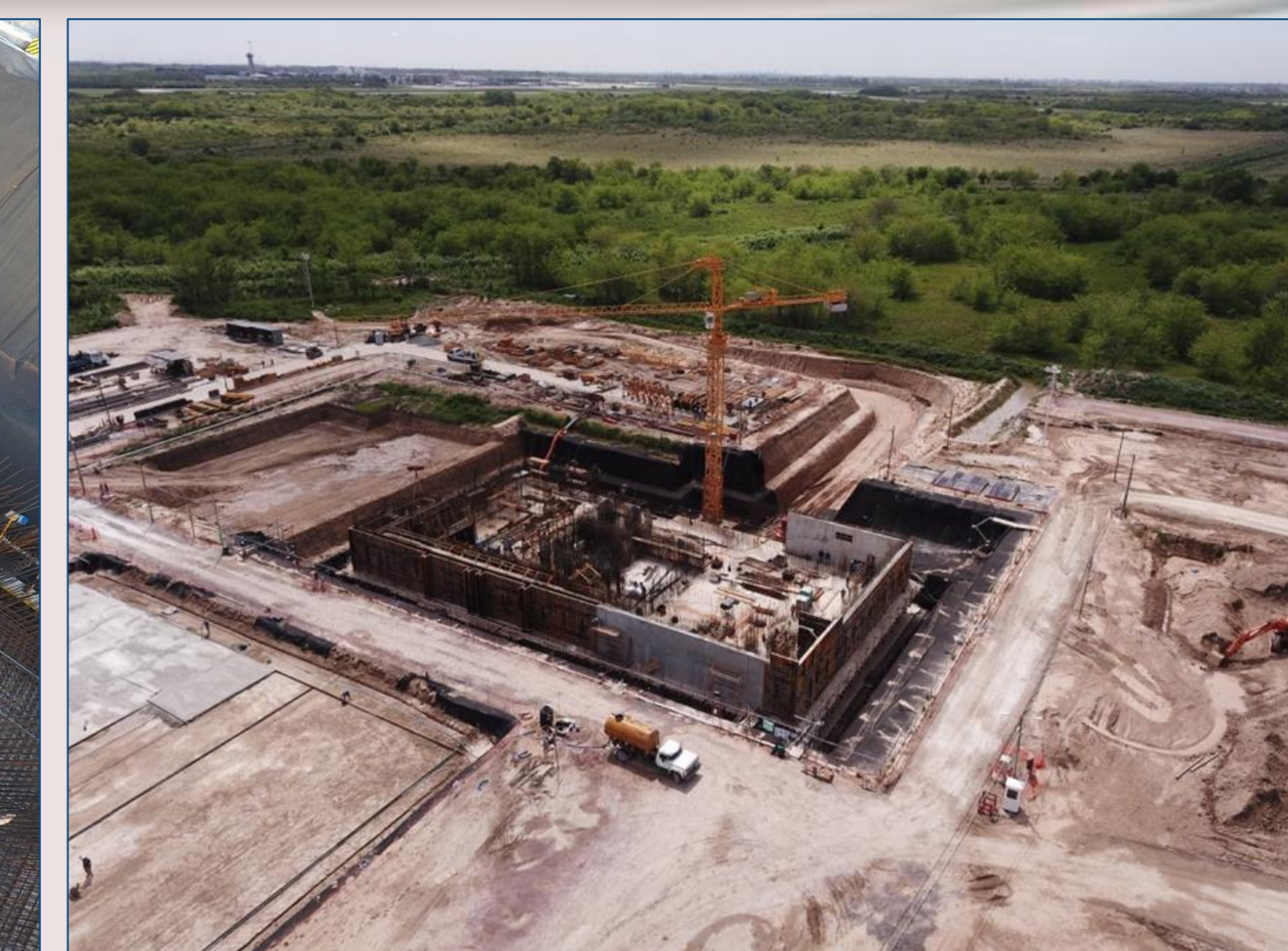
First quarter of 2018. Auxiliary building excavation finished. Reactor Building, construction advanced. Neutron Beam Building, started *