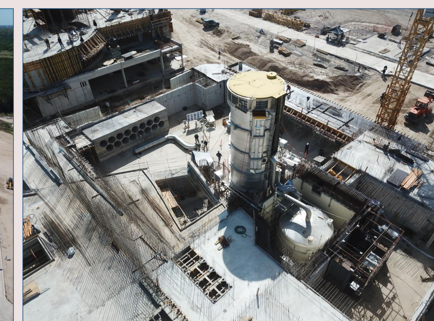
View of reactor pool – which is equivalent to the pressure vessel if it were a power reactor – is a strategic component because it will house the core of the RA-10 *