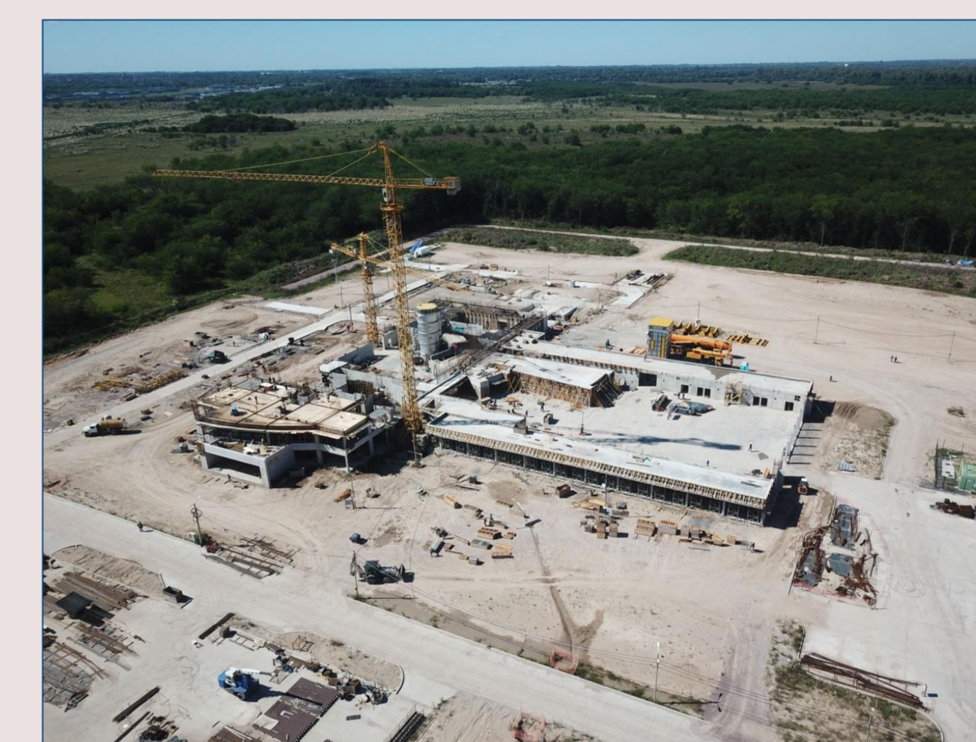
First quarter 2019: Panoramic view of the RA-10 construction *