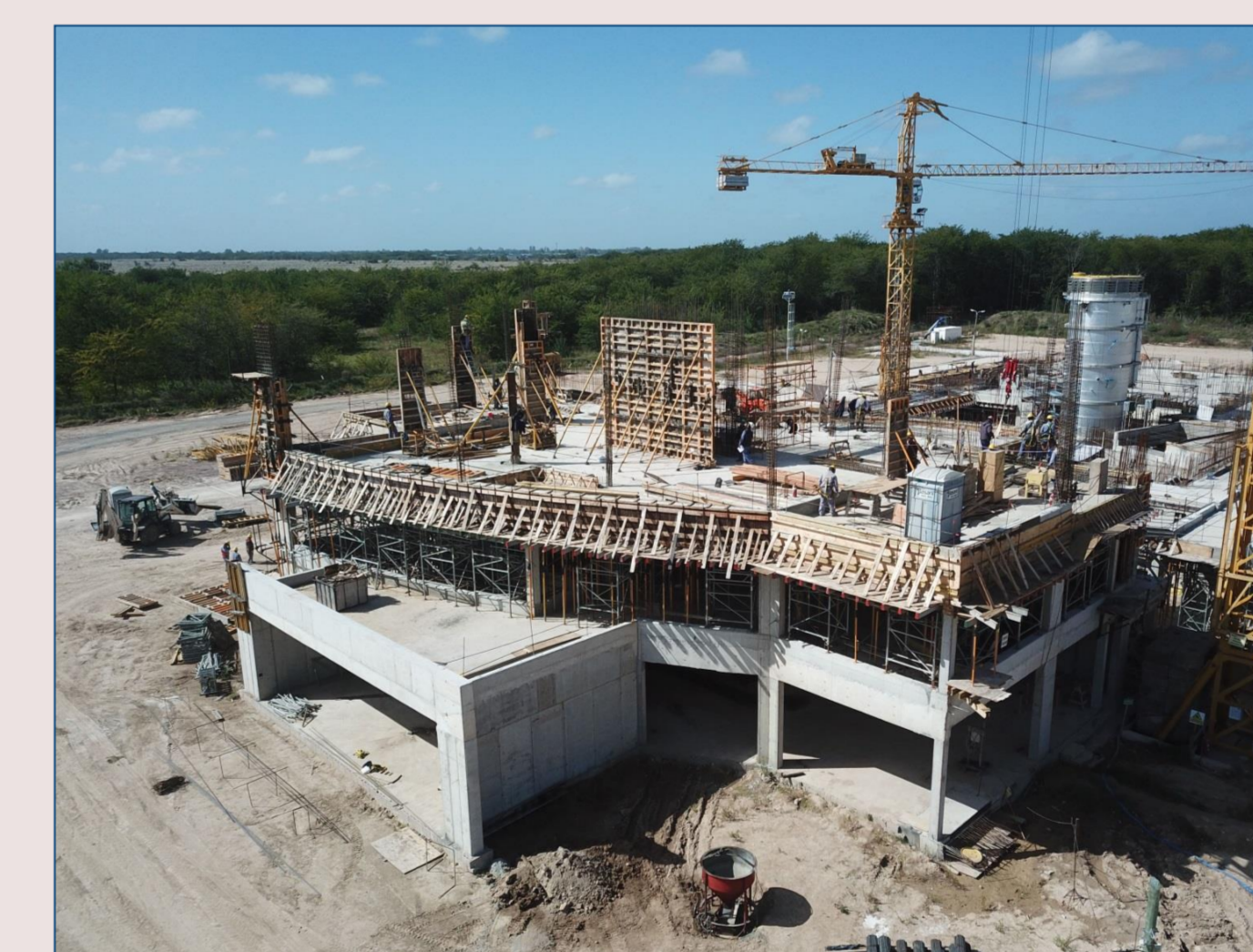
View of the construction of the auxiliary building *